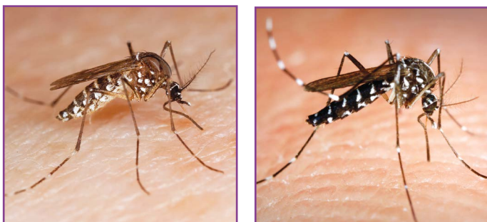
Figure 1. The yellow fever mosquito (left) and Asian tiger mosquito (right) are carriers of the Zika virus.

The most common way to contract Zika virus is from the bite of an infected mosquito. Two species of mosquitoes (Fig.1) spread the virus to people: the yellow fever mosquito ( Aedes aegypti ) and the Asian tiger mosquito ( Aedes albopictus ). Both are native to Texas.