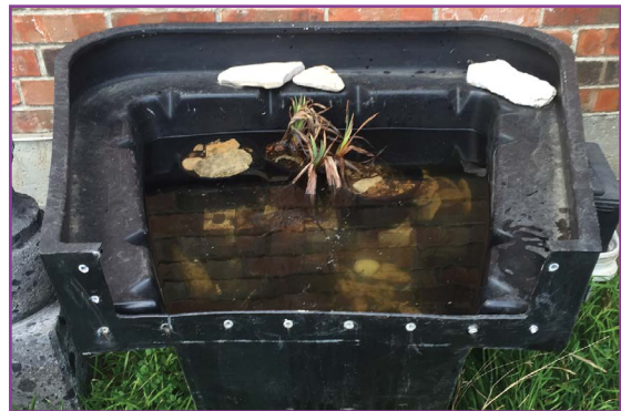
Figure 3. Drain or treat all standing water to prevent mosquito breeding around your home.

Insect repellents are much less likely to harm adults or children than are Zika or other mosquito-borne diseases such as West Nile virus.